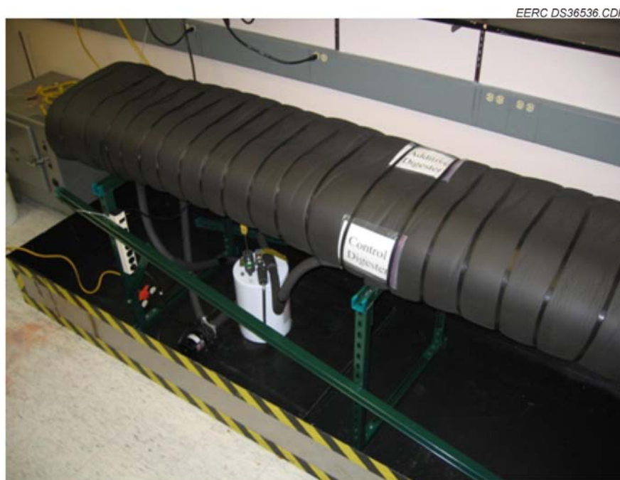
Figure 1. Reconfigured bench-scale digesters.